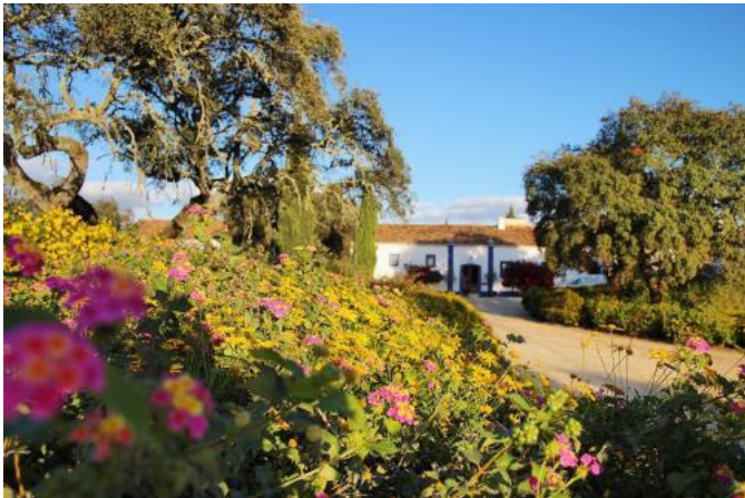
View of the stables

The 'Monte' or main building of the farm dates back to the Roman era with several additions over the years to create a traditional Alentejo farmhouse; the latest extensions adding stunning contemporary aspects to the building.